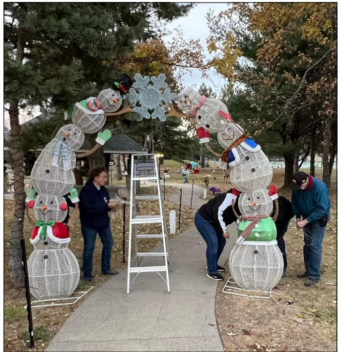
HOLIDAY SPIRIT. West Union Lions Club members assemble one of many holiday displays at West Union Recreation Park for the West Union Festival of Lights.

We are sorry for the loss of these dedicated Lions