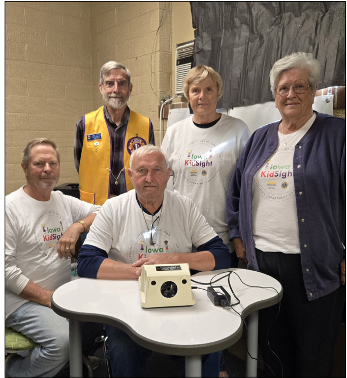
VISION SCREENING. The Peterson Lions Club sponsors the Kidsight program for Storm Lake and surrounding area schools. They have tested over 250 preschoolers for eye diseases and potential sight problems.