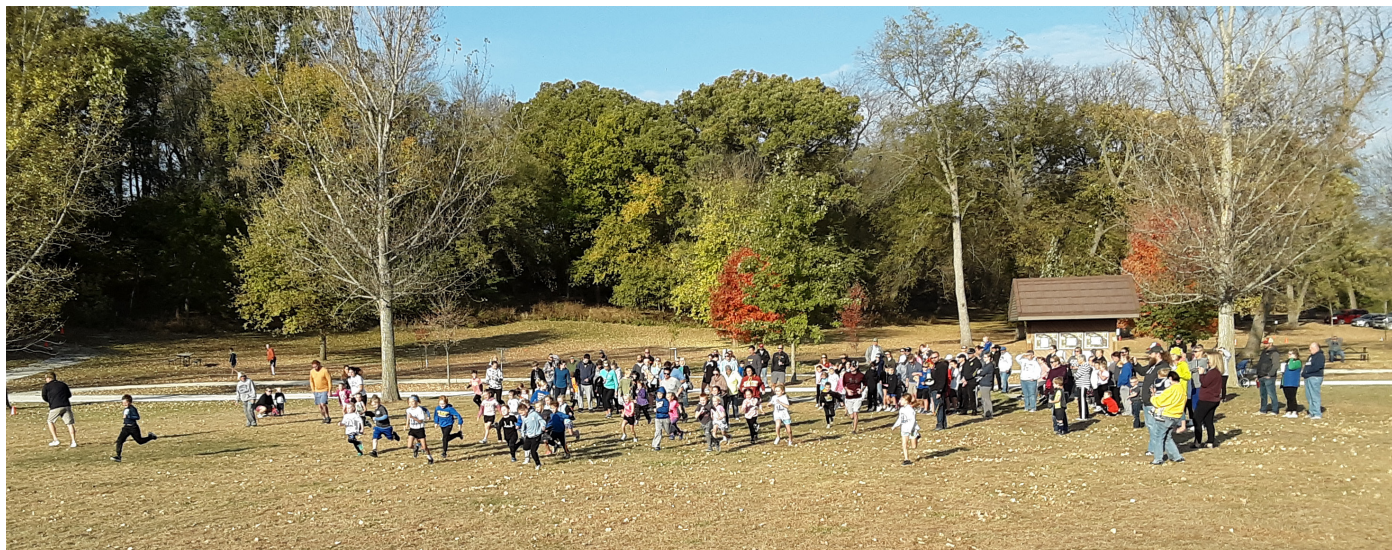
THE RACE IS ON. Humboldt school kids racing to get their pumpkin during the annual Humboldt Pumpkin Run.

As we move deeper into the holiday season (I define this by the amount of Christmas advertising on TV), please make sure to tell your family that you love them, don’t worry about eating too much, and keep things safe and mostly sane! Since we are all in the giving mode this time of year, remember that a gift to LCIF or the Iowa Lions Foundation is always a great idea!