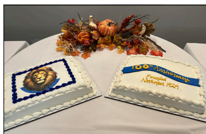
IT'S ALL CAKE. Davenport Village Lions Club's anniversary cakes celebrating 100 years.