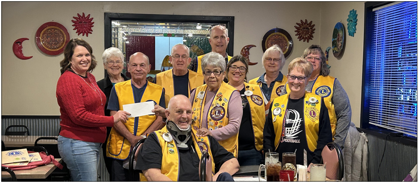
LET THE MUSIC PLAY ON. The Akron Lions Club presents a $250 check to the Akron Opera House building fund.